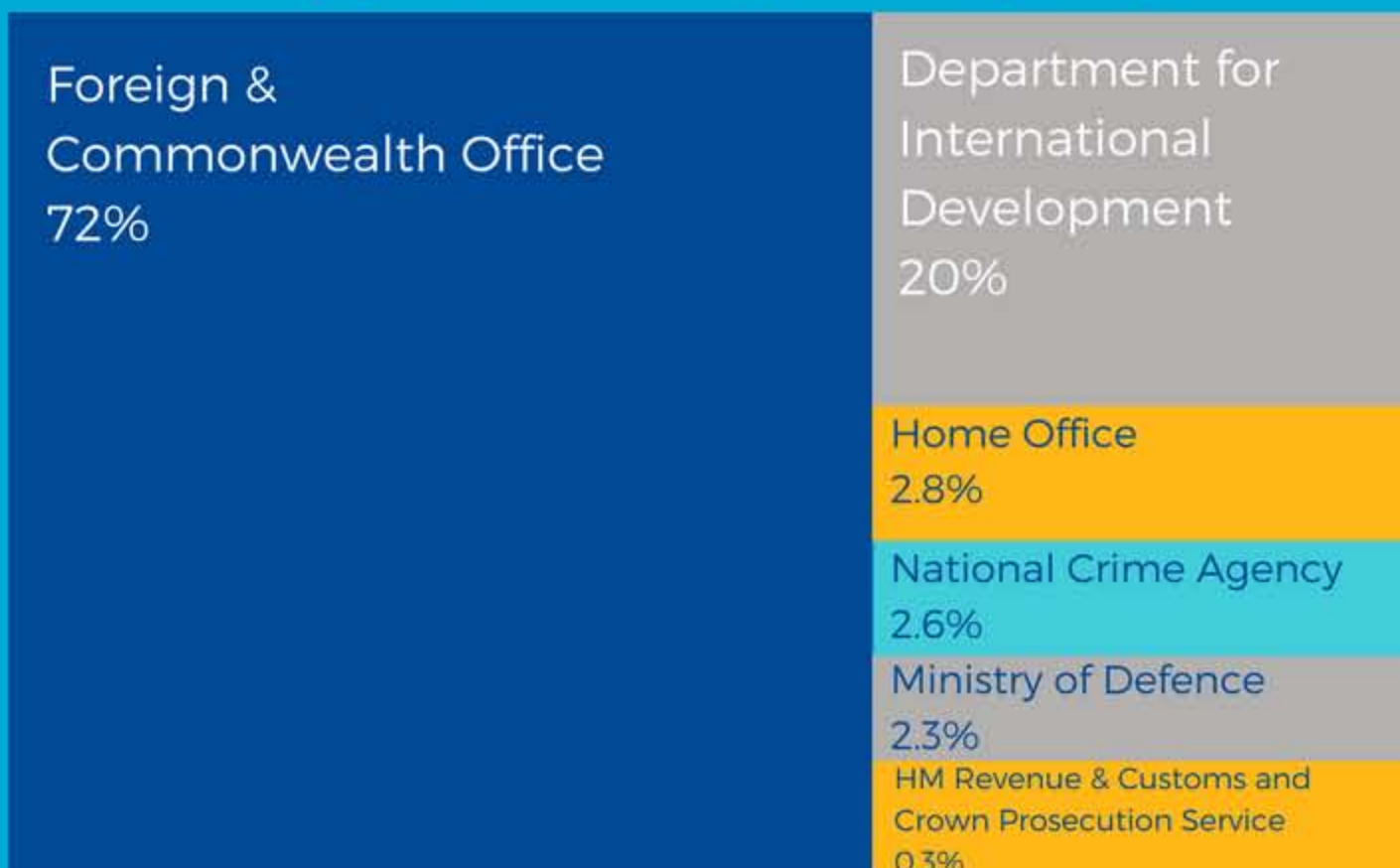
CSSF aid spend by government department (2016)