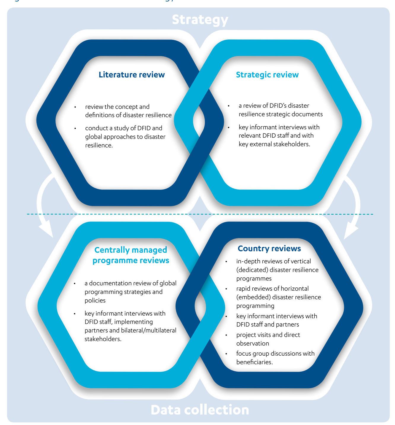
Figure 2: Overview of our methodology

Component 1 - Literature review: In order to identify current trends and good practices, we will undertake an analysis of the literature on disaster resilience. We will explore how disaster resilience is being integrated into humanitarian and development plans and strategies. Where possible, the review will gather information on DFID's approach relative to the approaches of other humanitarian and development stakeholders, such as recipient and donor governments, civil society organisations and the private sector. The literature review will explore different components of disaster resilience, including disaster risk reduction, disaster preparedness and disaster risk management. The literature review will enable us to situate DFID's disaster resilience approach, efforts, achievements and learning within the broader context of disaster resilience thinking and action worldwide.